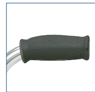
Contoured vinyl hand grip